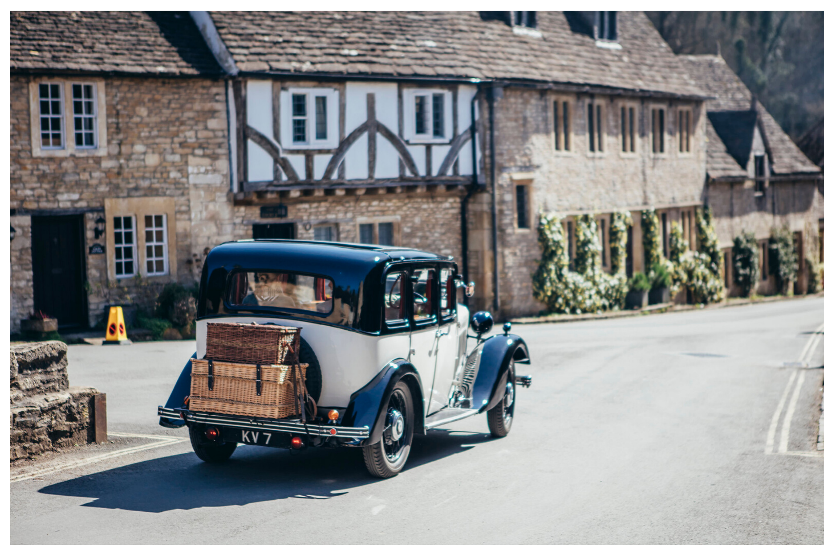
Castle Combe, the Cotswolds

Hotel du Vin Bristol 4* Bath Spa Macdonlad Hotel 5* Francis Hotel Bath - MGallery by Sofitel 4* The Old Bell Hotel, Malmesbury 4* Cliveden House, Windsor 5* Roseate House London, London 5*