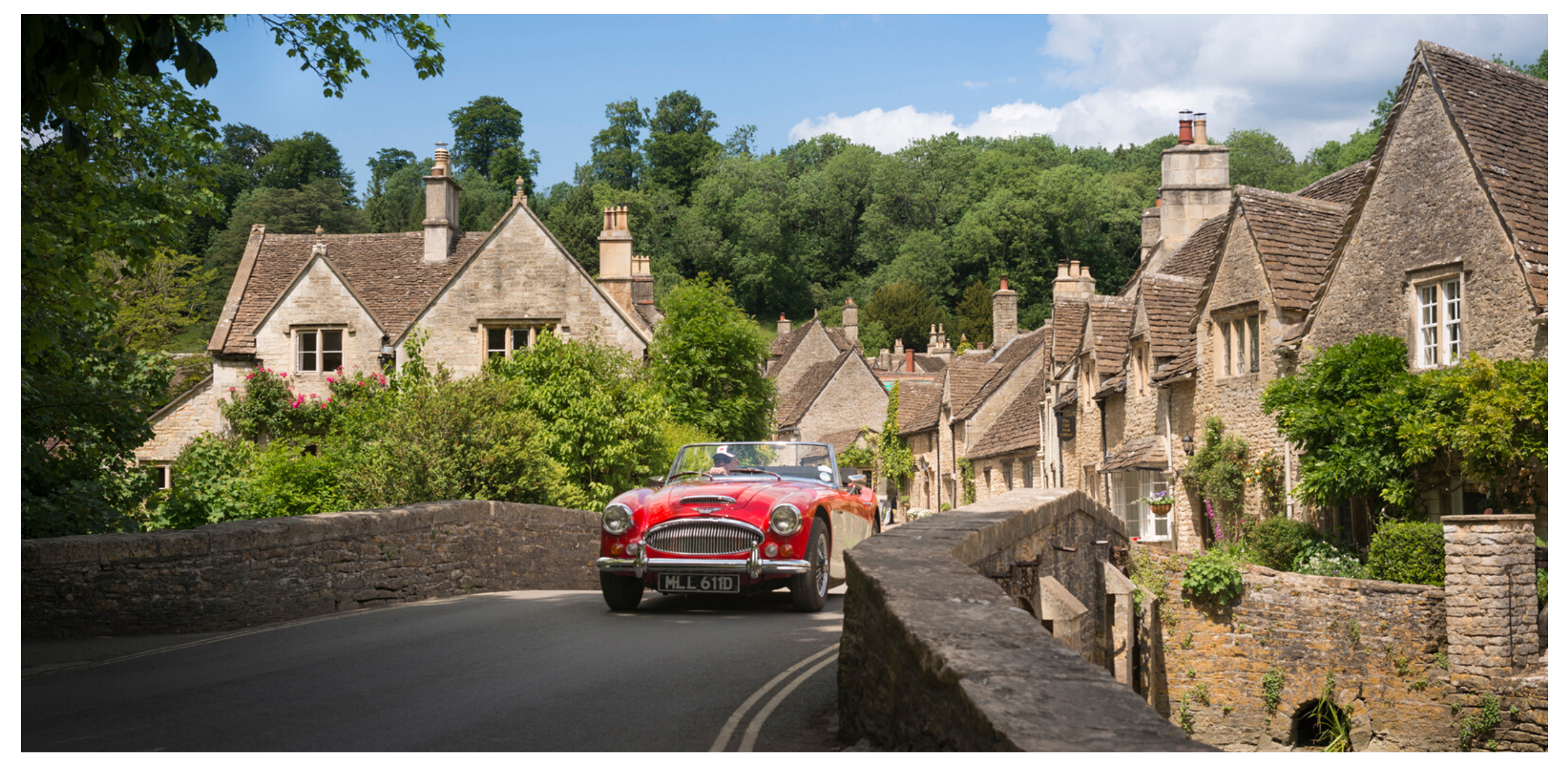
Castle Combe - Charlie Ross - credit Great West Way

BRISTOL - BATH - MALMESBURY - WINDSOR - LONDON 9DAYS - 8 NIGHTS